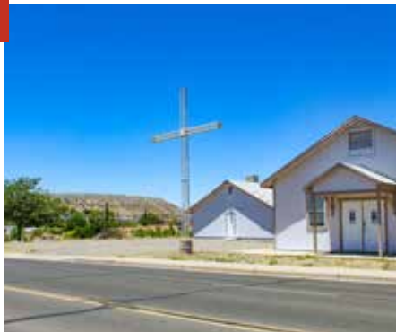
Southern Baptist Church 502 Lindahl

Christian Life Assembly (928) 848-6223 1 Palm