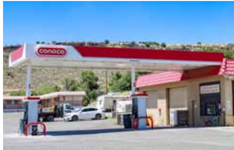
Conoco (Fuel and Propane) (928) 633-3159 Call to schedule