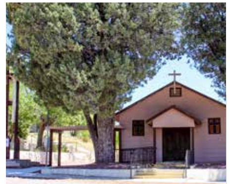
St. Francis Catholic Church (928) 633-2389 216 Cook

Pentecostal Church (928) 633-2112 140 Rincon