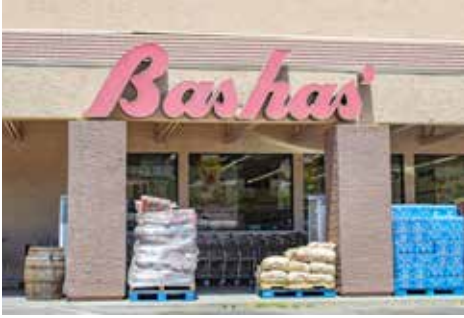
Bashas (928) 633-4599 105 Main